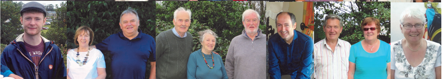
Team Outreach Speakers, Singers and Team Members