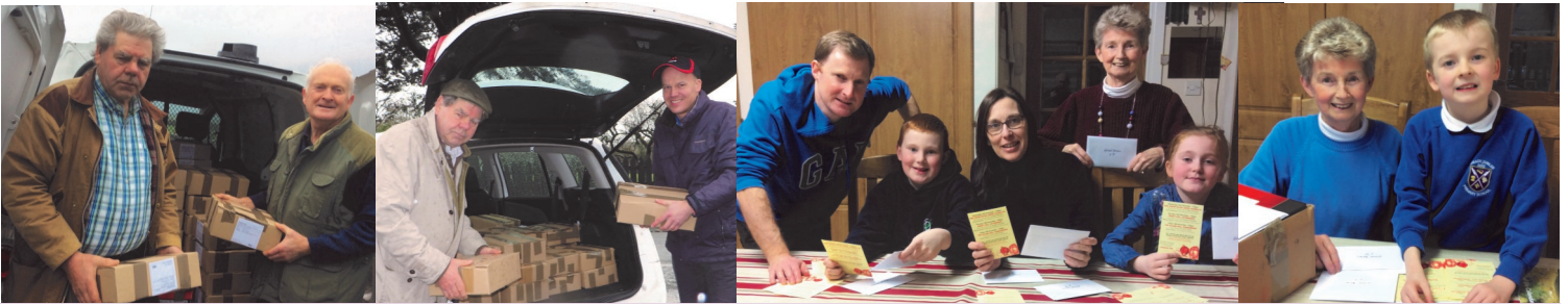
Preparing literature for Postal Distribution in Letterkenny/Fanad, County Donegal in December 2018