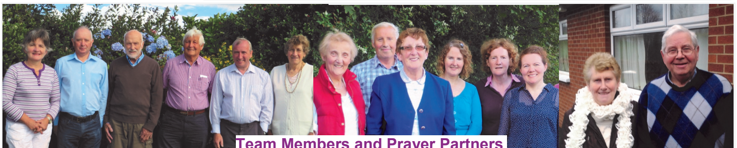
Team Members and Prayer Partners