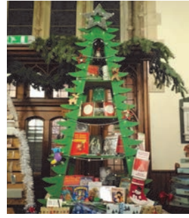
Rossorry Christmas Tree Festival