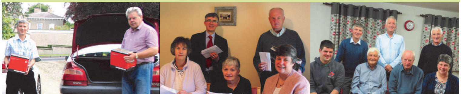
Preparing literature for Postal Distribution in Inishowen in August 2018