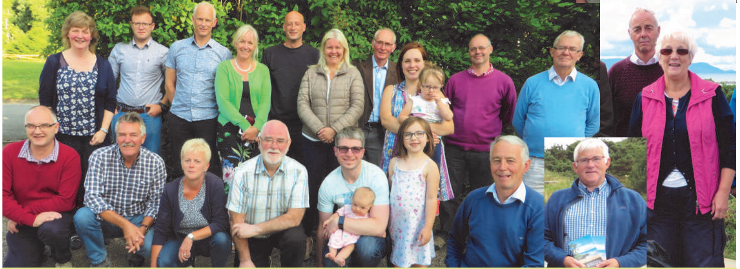
Volunteers at Croagh Patrick and Westport Outreaches