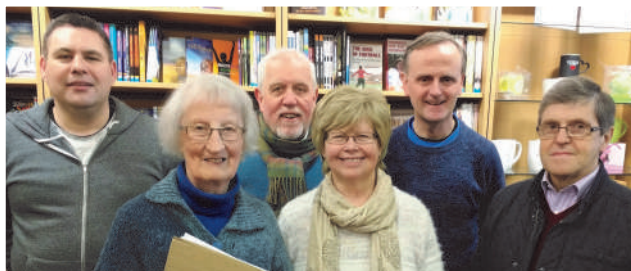
Friends who came to help us with stock taking

conscientiously with the new computer system, correcting data for all the Bibles, books, DVDs and CDs in the shop. We are nearly ready to start using the new system and trust that God will help as we adapt to this change.